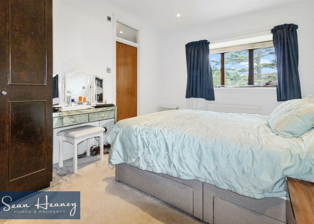
Bedroom 1 14'6 x 9'8 (4.42m x 2.95m)