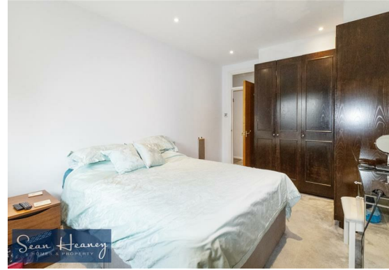
Bedroom 3 14'3 x 8'2 (4.34m x 2.49m)